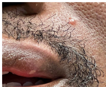
MVP Lesion, upper lip, face