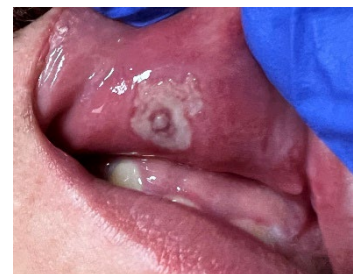
Intraoral MVP Lesion