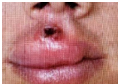
MVP Lesion, upper lip